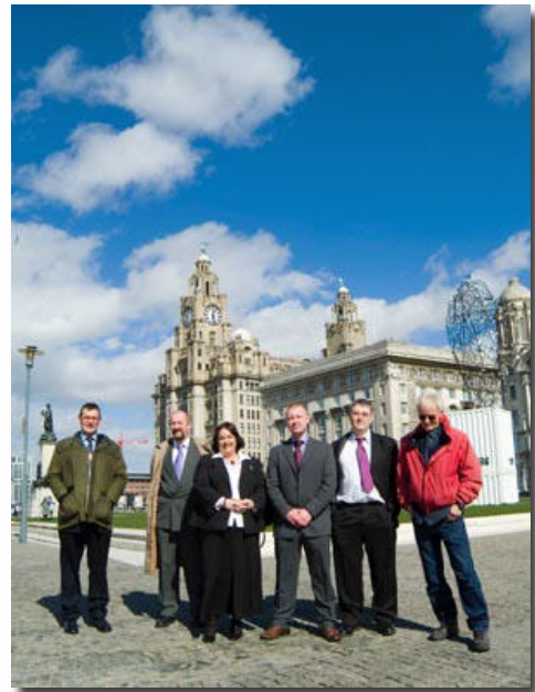
Rogues Gallery - the committee outside the Liver Building on launch day.

We are giving a presentation to Glossop Methodist Church on the 26th April about how our activities fit into the father's rights movement.