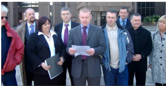
Our Deputy Party Leader reads out a statement in front of the Queen Elizabeth II courts in Liverpool on our launch.

Here we read out a statement explaining why we were starting a party. We are a pragmatic lot, and were not expecting a large crowd, and we weren't disappointed! Around twenty five members and supporters came to support us and listen, along with two reporters and a photographer.